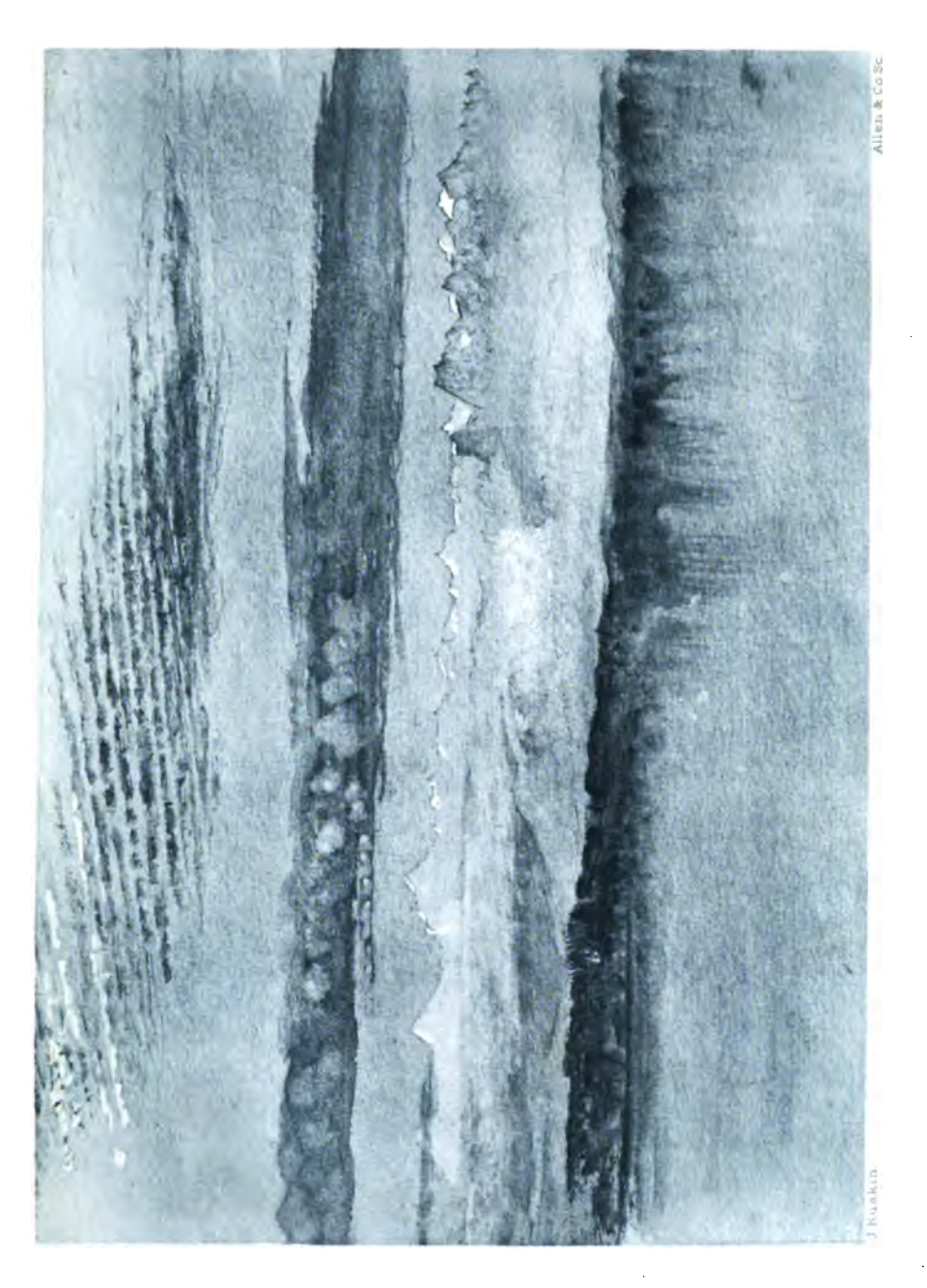
Digitized by Google